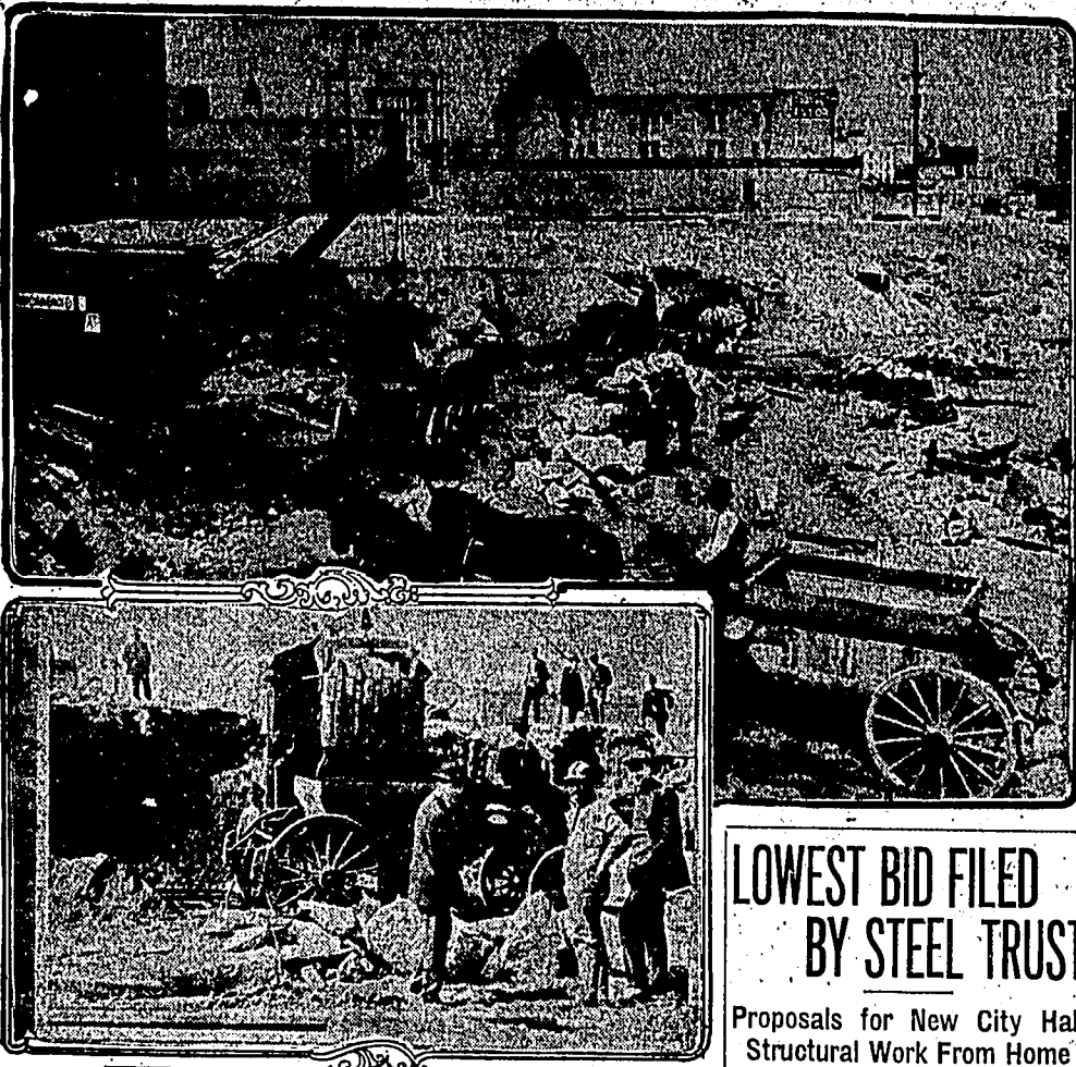
Scene showing steam shovel at work on new City Hall site, Van Ness avenue and Fulton street.